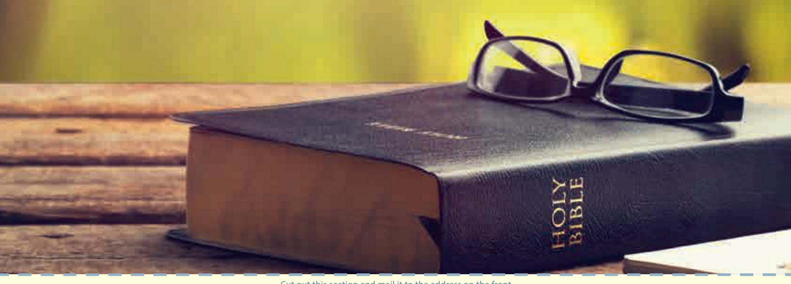
Cut out this section and mail it to the address on the front.

"The best thing to do with the Bible is to know it in the head, stow it in the heart, sow it in the world, and show it in the life." —Author Unknown