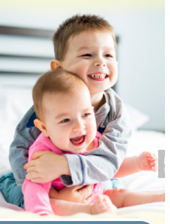
For more material on the home and family, fathers and mothers, husbands and wives, grandparents, and family finances, go to www.housetohouse.com.